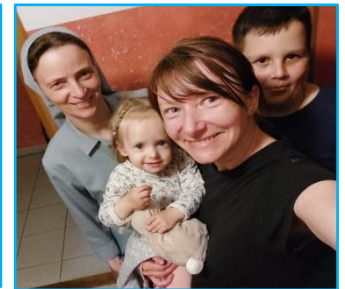
Children ,family and Canossian Sisters in Poland

Fundraising Campaigns for Ukrainian refugees in Poland was conducted by Meguro UNESCO general & youth members and Meguro GOHONGI Elementary School students in 2022. Thanks for your heartfelt support, we raised 366,625 Japanese Yen to help Ukrainian Refugees in Poland. 100% of your donation had been directed to Polish Chamber of Commerce and Industry in Japan and Canossian Sisters. They say donations from Meguro UNESCO will be used for Ukrainian refugee children's school fee and doctor's fee. Thank you for your generous donation to Ukrainian refugees in Poland. We would like to thank all the people involved, Polish Chamber of Commerce and Industry in Japan and Canossian Sisters.