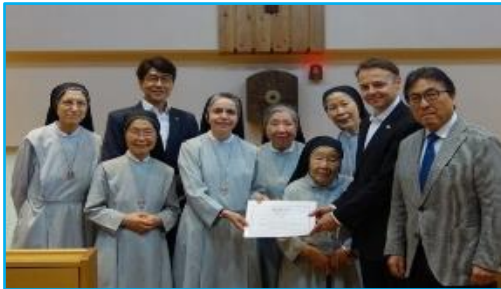
People from Polish Chamber of commerce and Industry in Japan and Canossian Sisters